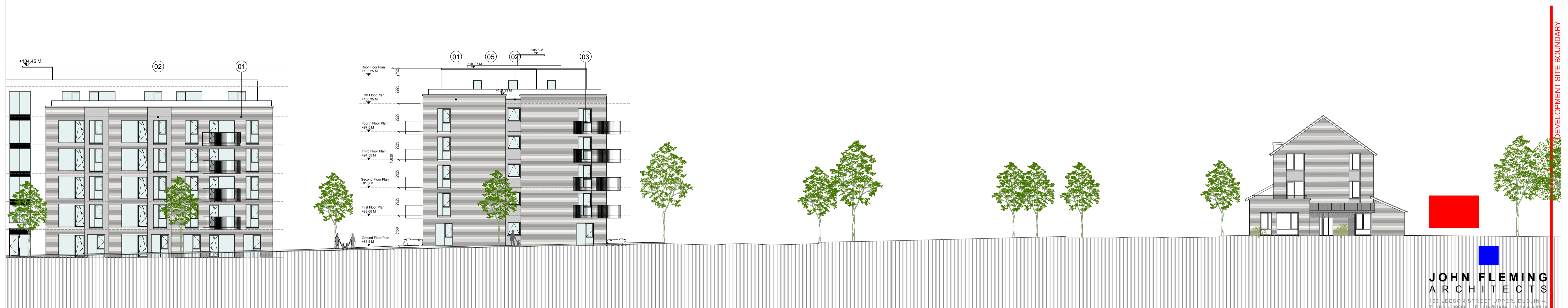
SITE SECTION A-A 1:200

JOHN FLEMING ARCHITECTS 103 LEESON STREET UPPER DUBLIN 4 T: 01-4535988 E: info@jf.a.ie W: www.jf.a.ie