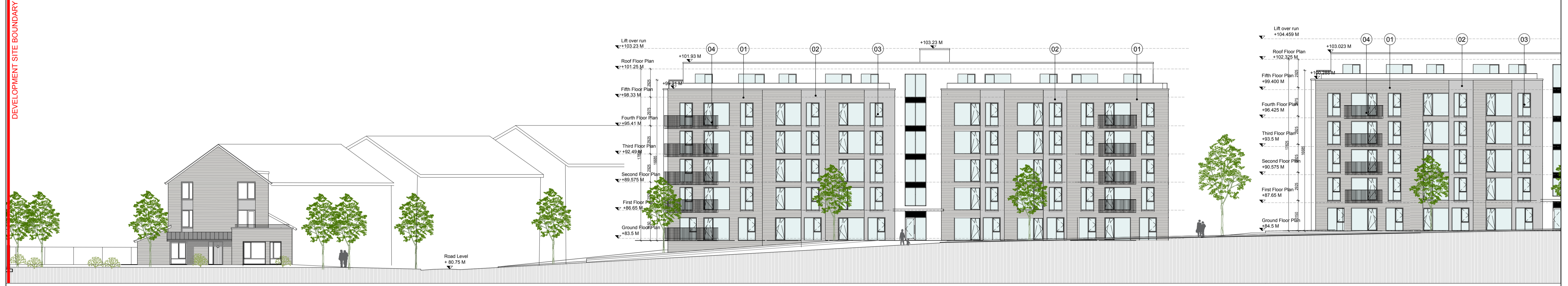
SITE SECTION A-A 1:200